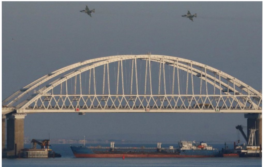
A pair of Russian fighter jets fly over a Russian tanker blocking access to the Kerch Strait

From 1945 to 1990, all Black Sea littoral states, with the exception of Turkey, were either Soviet Union members (Russia, Ukraine, Georgia) or part of the "Iron Curtain" (Romania, Bulgaria). The Black Sea was essentially a "Russian" or "Soviet Lake".