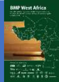
BMP West Africa