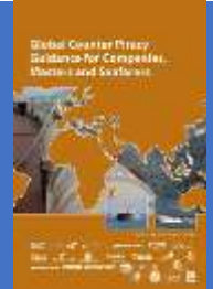
Global Counter Piracy Guidance